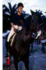
MS34- HORSE RIDING