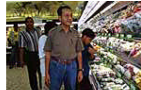
MS12-FOOD SHOPPING WITH FAMILY