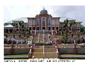
MS24-NEW PRIME MINISTER'S RESIDENCE