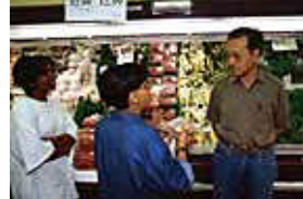
MS11-FOOD SHOPPING WITH FAMILY