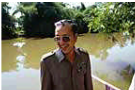
MS17-CAMPAIGNING IN HOME STATE KEDAH, 1999