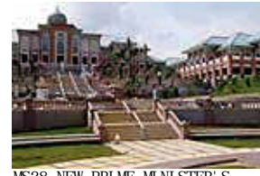
MS28- NEW PRIME MINISTER'S RESIDENCE