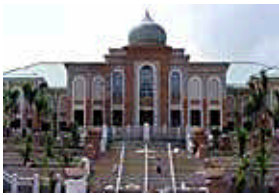
MS25- NEW PRIME MINISTER'S RESIDENCE