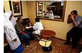
MS16-PHOTOGRAPH WITH FANS