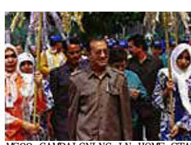
MS22-CAMPAIGNING IN HOME STATE KEDAH, 1999