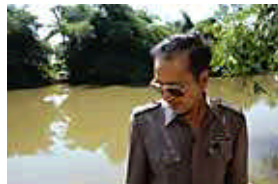
MS18-CAMPAIGNING IN HOME STATE KEDAH, 1999