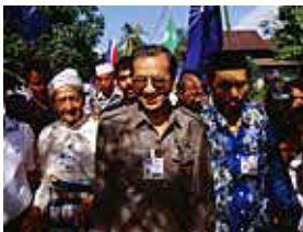
MS21-CAMPAIGNING IN HOME STATE KEDAH, 1999