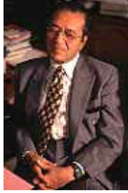
MS30- INTERVIEW, 1996