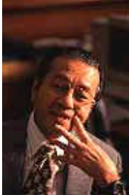
MS29- INTERVIEW, 1996