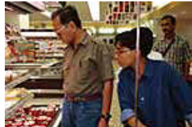
MS10-FOOD SHOPPING WITH FAMILY