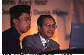
MS2-WITH COMPUTER, 1996