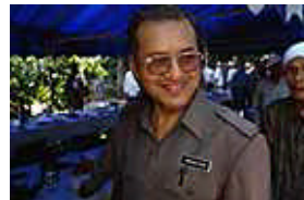
MS19-CAMPAIGNING IN HOME STATE KEDAH, 1999