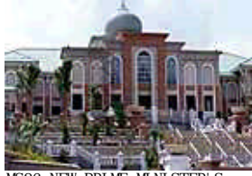
MS26- NEW PRIME MINISTER'S RESIDENCE