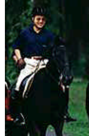
MS33- HORSE RIDING