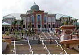
MS27- NEW PRIME MINISTER'S RESIDENCE