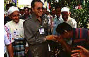
MS20-CAMPAIGNING IN HOME STATE KEDAH, 1999