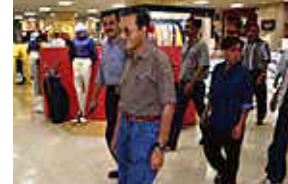
MS8-SHOPPING WITH FAMILY