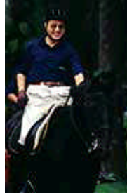
MS32- HORSE RIDING