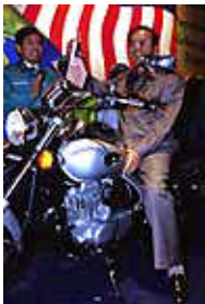
MS35- NEW MOTORCYCLE LAUNCH