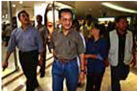
MS9-SHOPPING WITH FAMILY