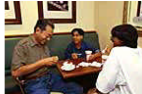
MS15-EATING WITH FAMILY